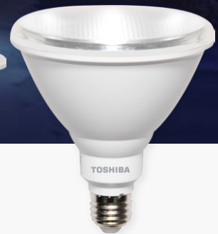
PAR38 IP 65