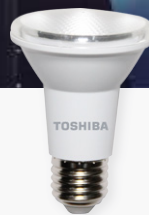
PAR20 IP 20

Remarkable and unique area by new TOSHIBA LED PAR lamp for indoor using such as Building, Restuarant, Department store and Gallery or use outdoor with weather proof socket fixture for Garden, Tree decoration and outdoor landscape. Comes with various of beam angle in 25 and 35 degree.