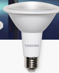
PAR30 IP 65